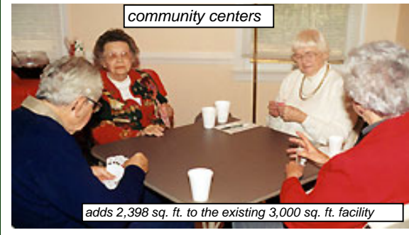
adds 2,398 sq. ft. to the existing 3,000 sq. ft. facility