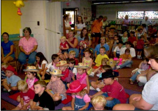
Example of space constraints during children's activities